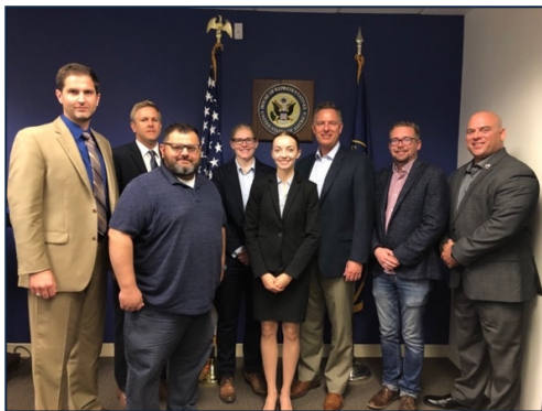
VES organized a district meeting in San Diego for Rep. Scott Peters (D-CA) with student veterans