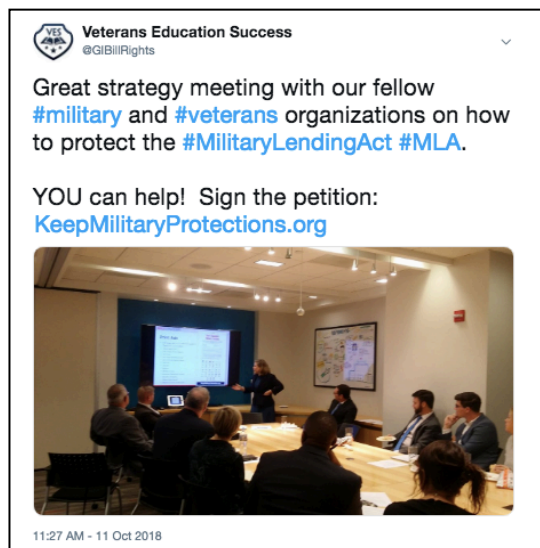
VES hosted policy briefings for veterans & military leaders, Congressional and VA staff

Public education is a key part of our work. VES staff hosted 7 policy briefings for veteran and military organizations on key policy issues, testified at 7 federal government hearings, and spoke at nearly 3 dozen public panels, press conferences, and speeches in 9 states and DC to educate the public.