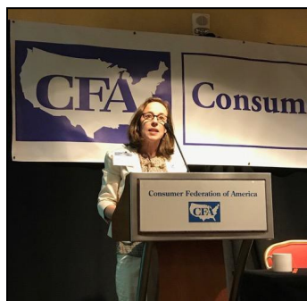
President Carrie Wofford at National Consumer Assembly