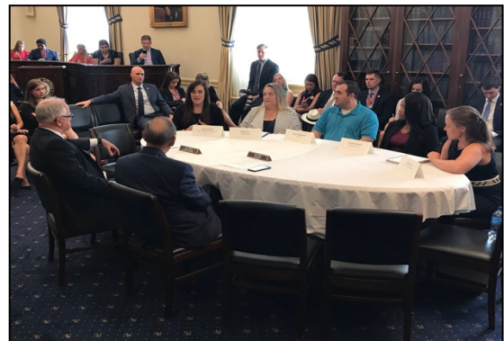
VES' panel discussion with the Chair & Ranking of the House Veterans Affairs Committee