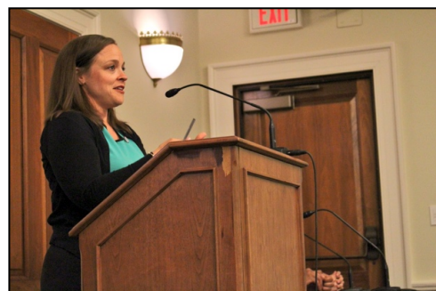
VES traveled nationwide to speak at public events